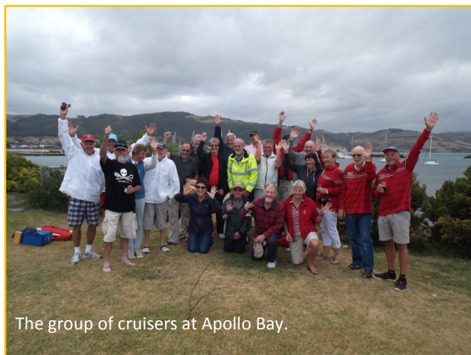
The group of cruisers at Apollo Bay.