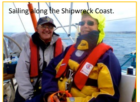
Sailing along the Shipwreck Coast.

it again and we moored at 7.30 am after a 21 hour sail.