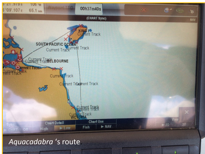
Aquacadabra 's route.