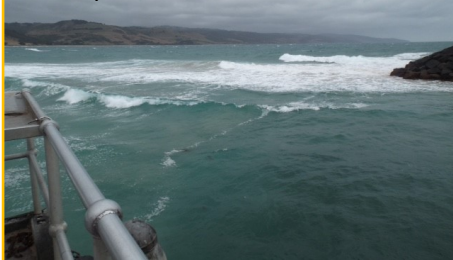
Apollo Bay entrance in established easterly.

ny with Andalu-cia , Mirrabooka , Aquacadabra , Y-Knot and Enya . Then on the tail of an easterly wind we followed Acquacadabra , Y-Knot and Mirrabooka westward after some conflict with a wave