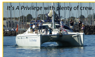
It's A Privilege with plenty of crew.

That was a day that was. Cruisers sailing to Royals for lunch with crews / passengers comprised of sabot/opti kids and parents. We on ' Andalucia ' had three boys and two adults. I must say that the boys were extremely well behaved. I must also totally refute any suggestion that when they had a turn on the helm they proved to be better sailors than yours truly. Oh OK would you believe they were only a little bit better. Now look here, I will admit that I was having a bad day on the water so let's leave it at that.