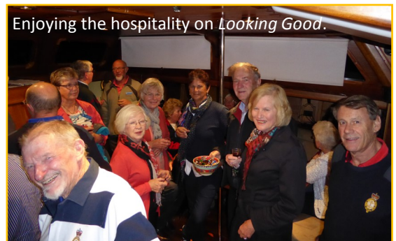
Enjoying the hospitality on Looking Good .