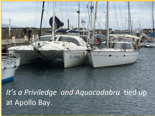
It's a Privilege and Aquacadabra tied up at Apollo Bay.