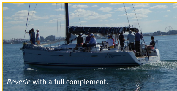
Reverie with a full complement.

Another great day out was shared by two groups of our club giving the juniors a 'Big Boat' experience.