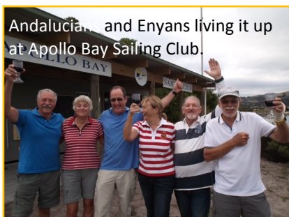
Andalucia and Enyans living it up at Apollo Bay Sailing Club.

This years cruise was notable for several reasons: