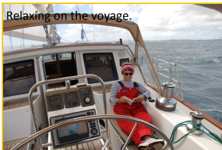
Relaxing on the voyage.