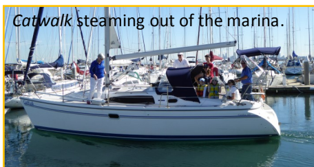
Catwalk steaming out of the marina.