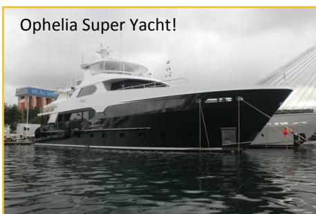
Ophelia Super Yacht!

Or one can row about 300m to view Ophelia Super Yacht.