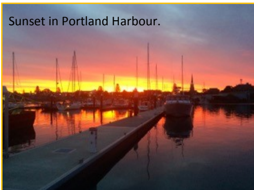
Sunset in Portland Harbour.

told us of the 2 cruise ships which had visited during the week. We met up with members of the Portland Yacht Club as they were preparing for their afternoon races. Roger's help on the flag and rescue boat was welcomed and David crewed on another 34ft keelboat. They were a friendly lot.