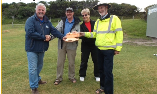
Winners of Bocce competition, Sun Kiss , accepting the trophy.

to the surges, or rafted together along-side the main jetty.